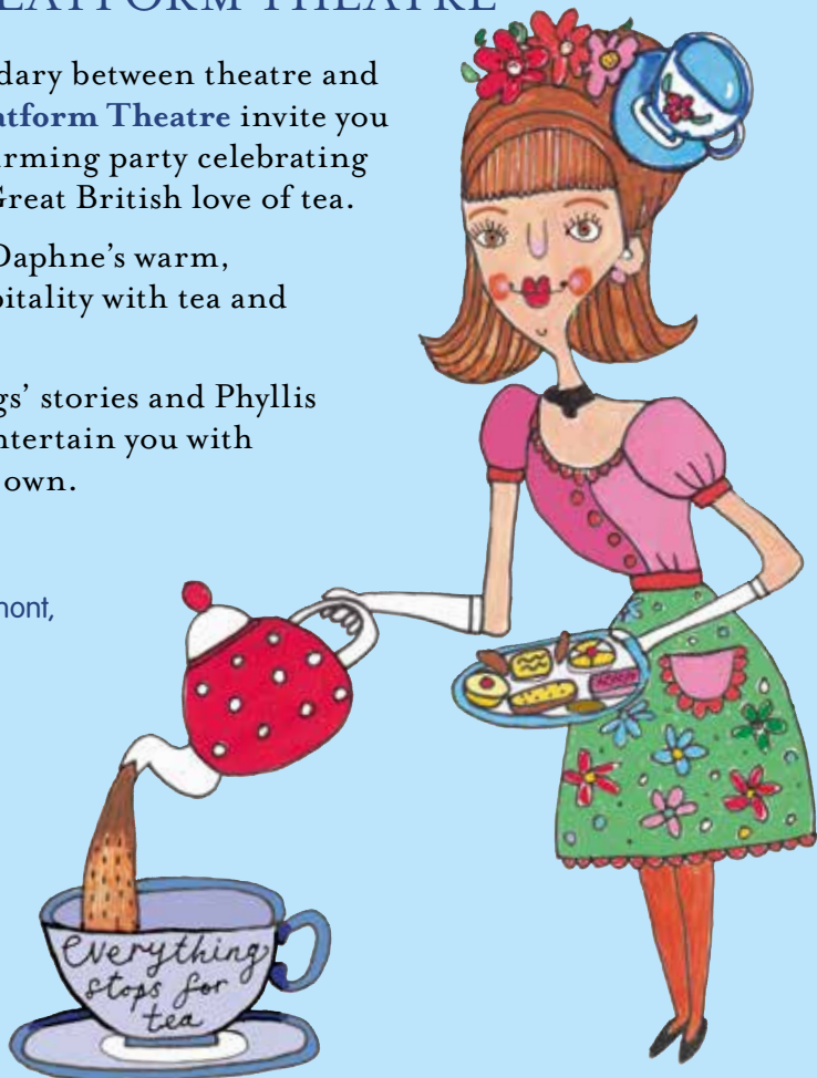
ILLUSTRATION: © SARAH EVANS