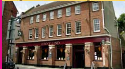
01424 421 392 www.jennylin dhastings.co.uk