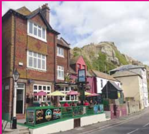
THE DOLPHIN Tel: 01424 431197 Rock-A-Nore Rd TN34 3DW